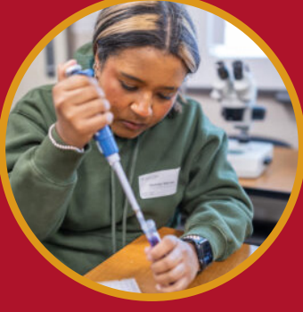
Discovery Day Hamilton Health Sciences

In partnership with Canadian universities, hospitals and research centres, we inform and excite Canada's youth about the wide variety of career options in medicine and health care. By connecting high school students to world-class researchers and clinicians in real-life settings, we are helping to build our future health workforce.