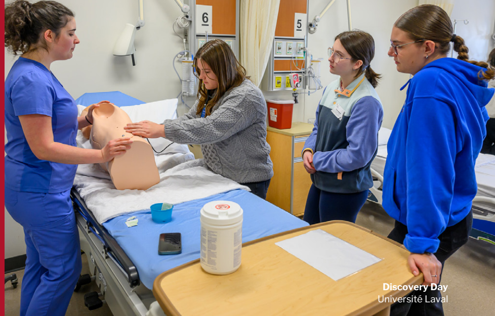
Discovery Day Université Laval

Student, University of Alberta Discovery Day