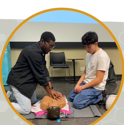
Discovery Day McGill University

"De sportif blessé à thérapeute: le parcours vers la physiothérapie"