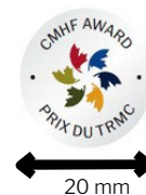
CMHF Award Pin