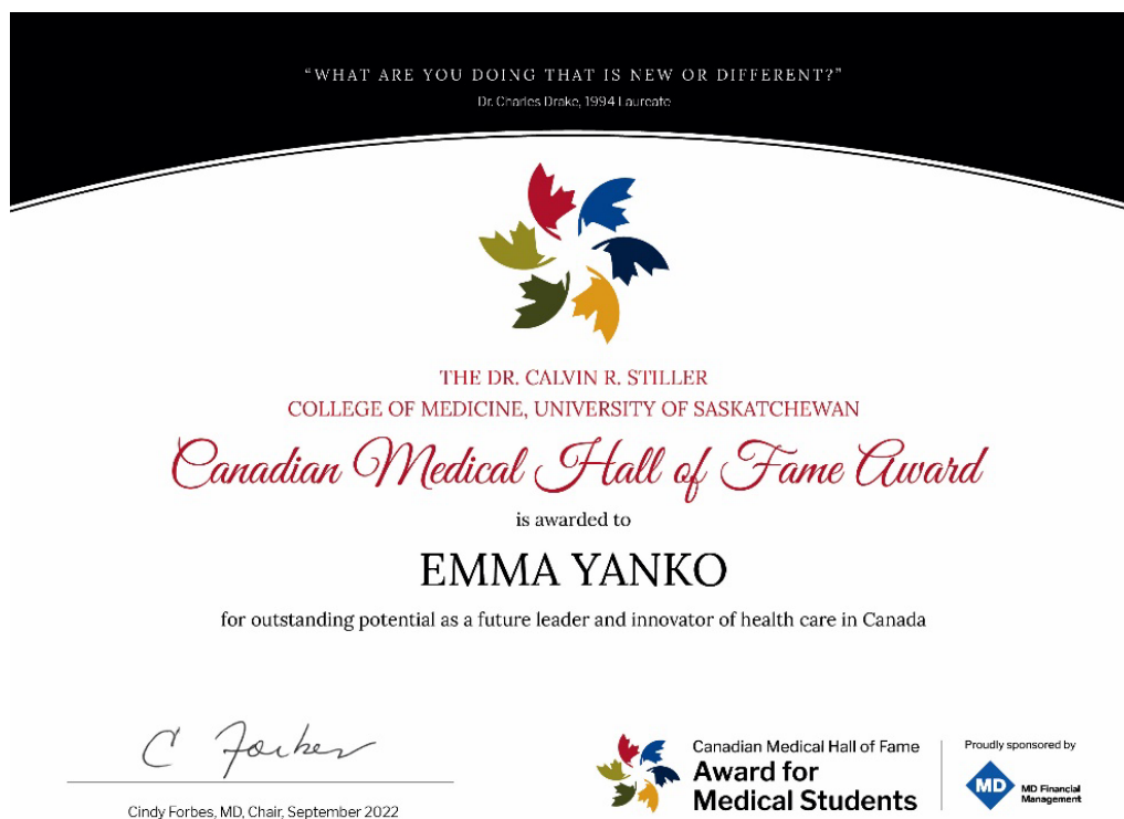
CMHF Award Plaque