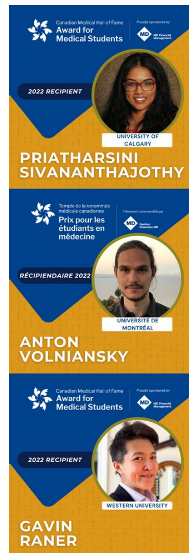
Sample social media posts : Recipient Announcement