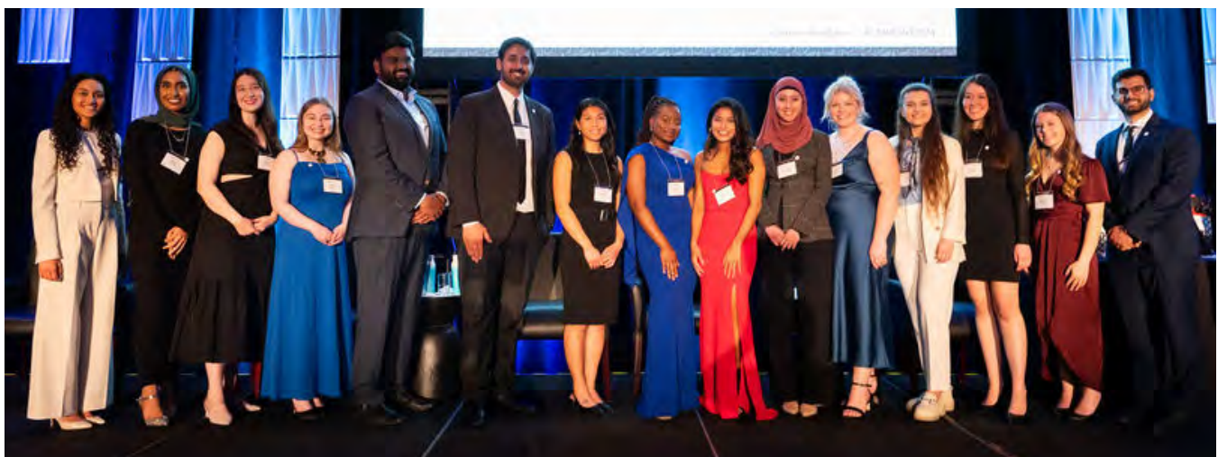
2023 CMHF Award Recipients at the 2024 Induction Ceremony in Vancouver, BC