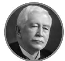
The Late Sir Thomas Roddick, MD Montreal, QC