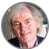
Pieter R. Cullis OC OBC PhD FRS Vancouver, BC