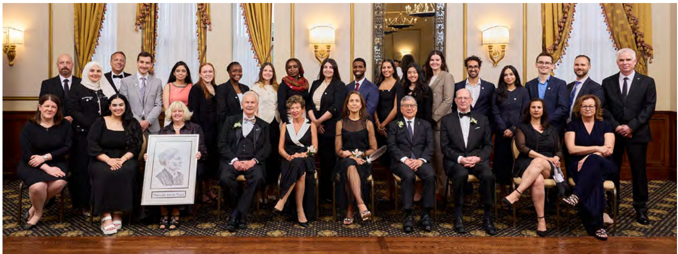
2024 CMHF Award Recipients at the 2025 Induction Ceremony in Hamilton, ON